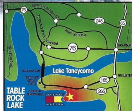
TABLE ROCK LAKE